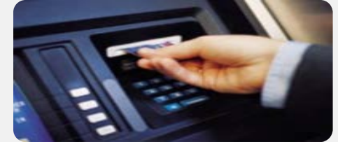
Financial & Administrative

Leveraging the best industry solutions to increase productivity, lower costs and strengthen our customer's brand!