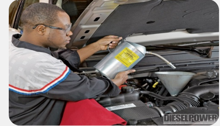
Owner Loyalty & Service Marketing