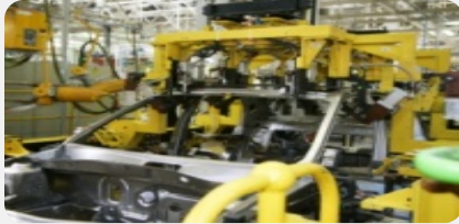
Manufacturing Plants & Distribution Centers