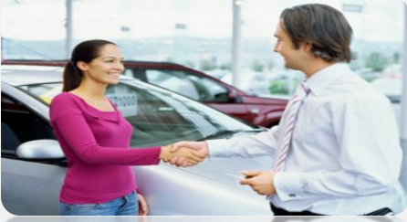
Customer Acquisition, CRM & Agency