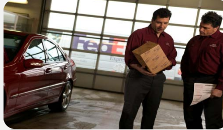
Dealer & Consumer Fulfillment