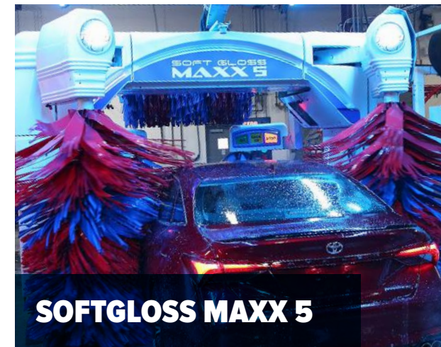
SOFTGLOSS MAXX 5