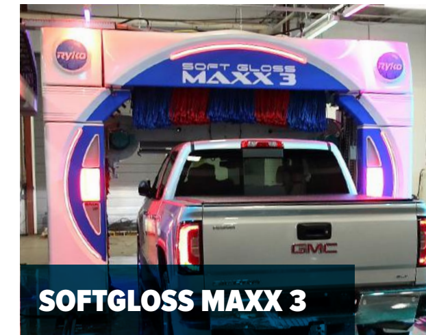
SOFTGLOSS MAXX 3