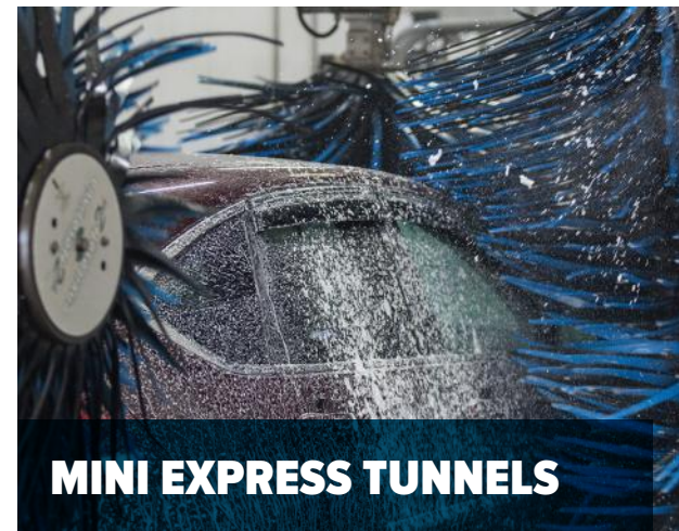
MINI EXPRESS TUNNELS